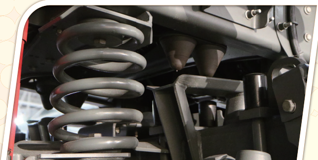
Spring Load Measurement