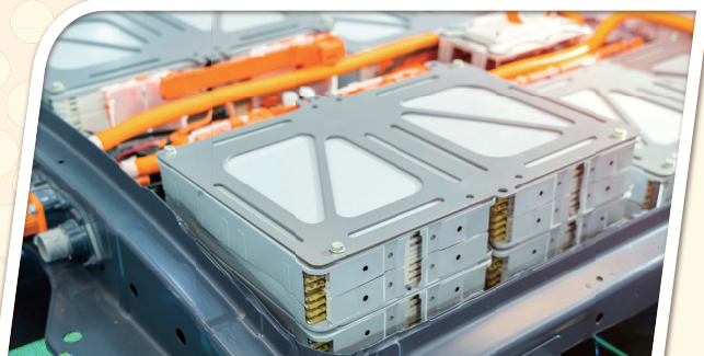
Battery Swelling Force Measurement