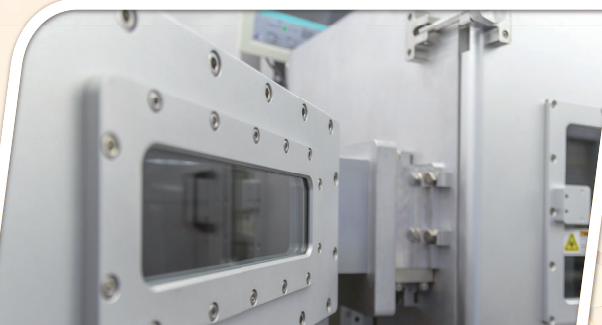
High-temperature Environment Testing