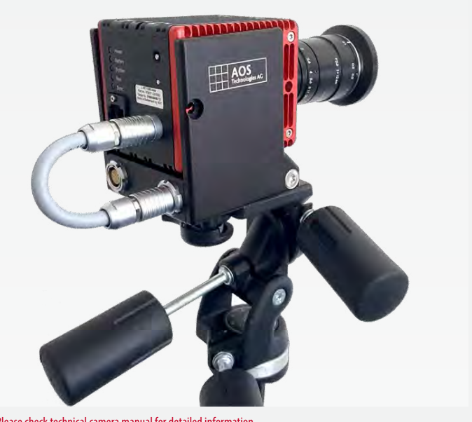
Please check technical camera manual for detailed information