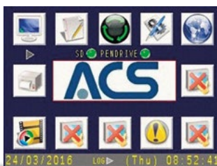
KeyKratos - Main window