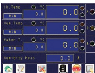
KeyKratos - Main control parameters